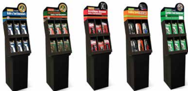
(001FS) (005/014FS) (DPFS) (700FS) (006FS)

Dimensions: 14" wide x 14" deep x 58" tall. Interior: 13" x 21"