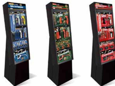
(MLTFS-CLS) (MLTFS-OUT) (MLTFS-PRO)

Dimensions: 14" wide x 14" deep x 58" tall. Interior: 33 1/2" x 13 1/2"